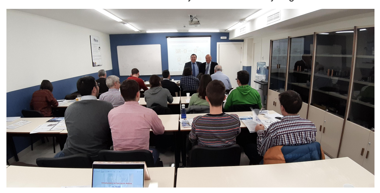
CU00: Additive manufacturing Process Overview - Conducted by CESOL in Madrid, January 7th of 2020

The first courses in the AM Qualification System have officially begun.