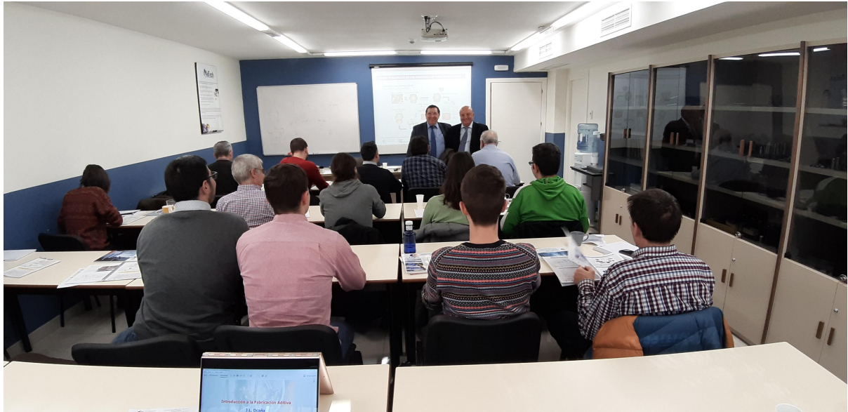
CU00: Additive manufacturing Process Overview - Conducted by CESOL in Madrid, January 7th of 2020

The first courses in the AM Qualification System have officially begun.