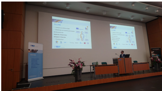
DVS Mid Term Conference – 12th of November 2019 in Halle, Germany