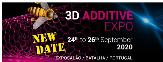
3D Additive Expo - 24th - 26st of September 2020 in Batalha, Portugal