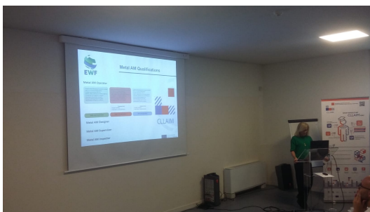
EWF CU00 conference at ISQ - Lisbon, Portugal