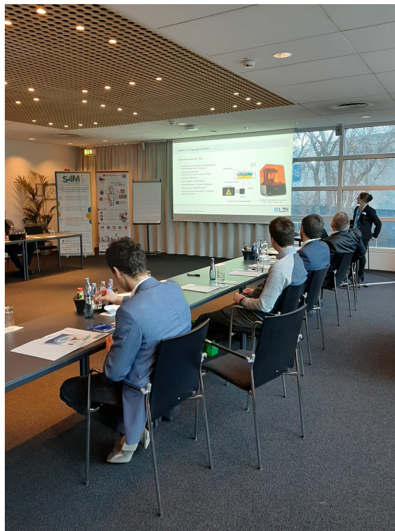
CU00: Additive manufacturing Process Overview - conducted by LAK in Hanover, 25th of February of 2020